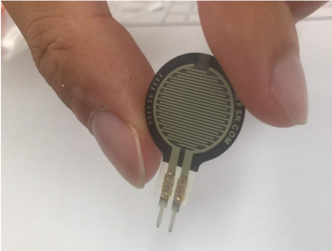
Fig. 1: pressure sensor